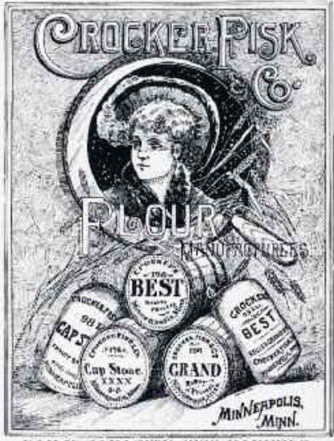
AILY CAPACITY, 1200 BARRELS.

Flour bags began replacing barrels in the late 1880s, an ominous sign for coopers. Standard barrels held 196 pounds of flour; bags held half as much. (Northwestern Miller, Holiday Number, 1889)