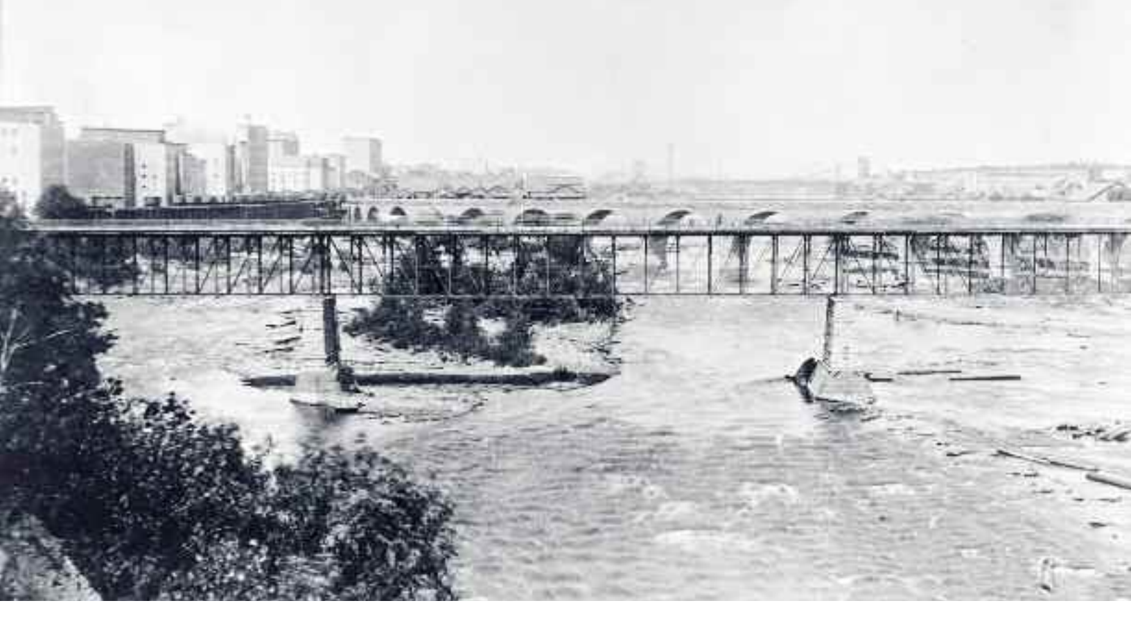
River crossings: Tenth Avenue bridge across the Mississippi, with the west-side flour mills at left; the Stone Arch bridge, midground; and the Hennepin Avenue suspension bridge barely visible in the background, 1888.

signed contracts guaranteeing 15 cents per barrel until July 1, 1887, and then gave financial support to the journeymen still out. Within a few days the boss shops signed on, and the strike ended. Any hope, however, that this pact would last longer than previous ones soon evaporated when at least two boss shops attempted to break the agreement, one by locking out its workers and the other by simply reducing wages.<sup>44</sup>