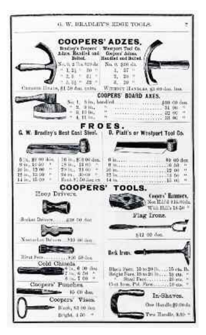
One of three pages of coopers' tools from Connecticut company G. W. Bradley's edge-tool catalog, 1876

Central to cooperation's appeal was the independence barrel makers could achieve, either in the exercise of their craft or from their erstwhile bosses. Yet central to the meaning of cooperation was how coopers interpreted this independence. While some developed an expansive, class-oriented definition of cooperation that emphasized the greater good of their community, others adhered to a narrower notion confined to the benefit of one firm at the expense of others. Such differences generated much conflict among Minneapolis